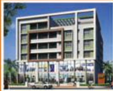
VISHNU PARADISE 88F, NSC Bose Road, Kolkata 700040