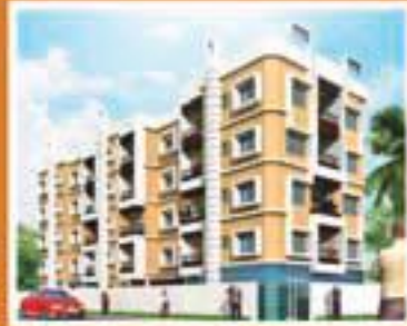
VISHNU MAHAMAYA 1052, Mahamayatala, Kolkata 700084