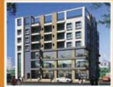
VISHNU KING'S COURT 227, NSC Bose Road, Kolkata 700040