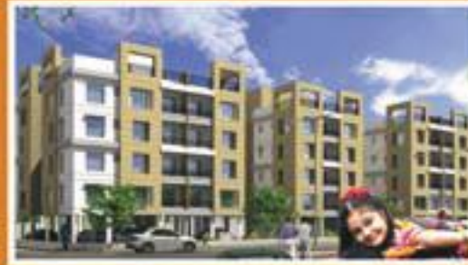
VISHNU REGENCY 486, Raynagar, Kolkata 700070